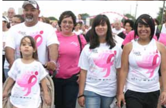
Susan G. Komen and family

Susan G. Komen fought breast cancer with her heart, body and soul. Throughout her diagnosis, treatments, and endless days in the hospital, she spent her time thinking of ways to make life better for other women battling breast cancer instead of worrying about her own situation. That concern for others continued even as Susan neared the end of her fight. Moved by Susan's compassion for others and committed to making a difference, Nancy G. Brinker promised her sister that she would do everything in her power to end breast cancer forever.